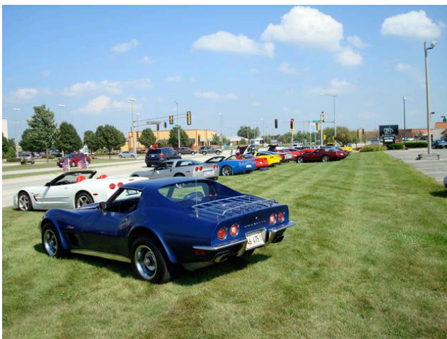
(above) Club car display at Za's on August 9.