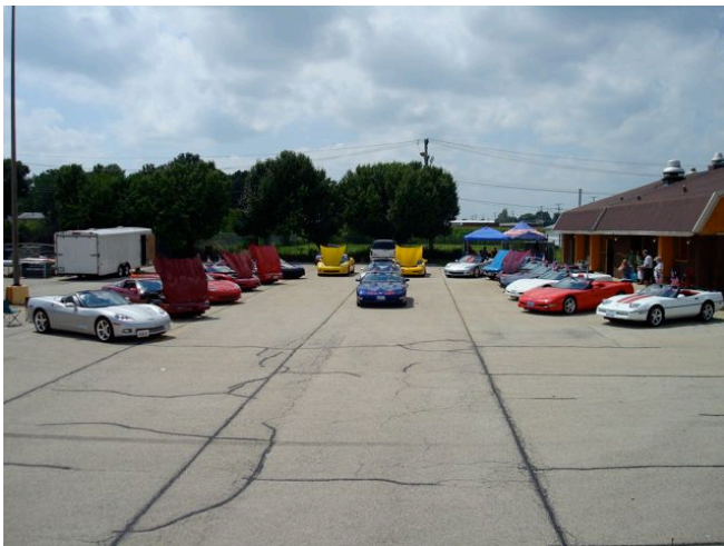
Club Car display at El Toro in Rantoul on August 8.