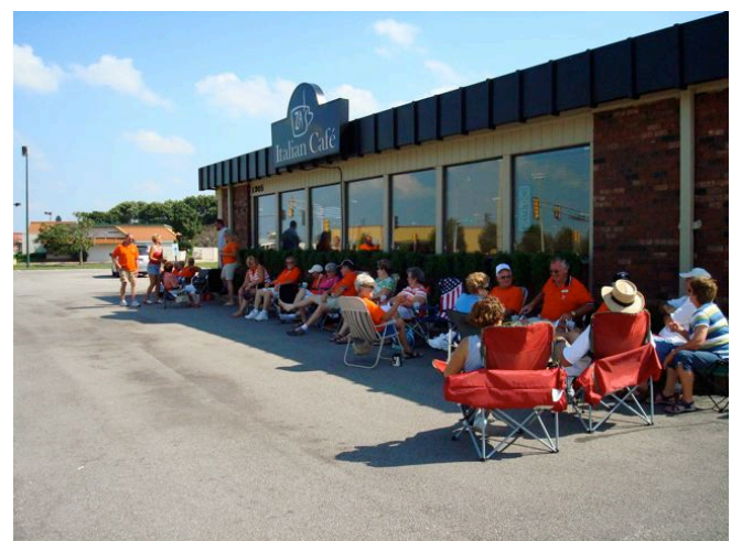
(above) Club members escape the sun at Za's.