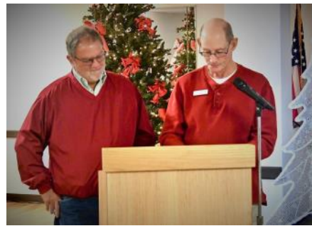
Christmas Party December 3, 2022