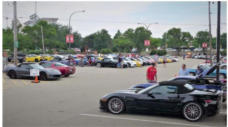
Bloomington Gold 2022 in Normal, IL

Bloomington Gold celebrated its 50th event June 10-11 by returning to Normal after 20+ years away from the Bloomington-Normal area, where it all began. The campus of Illinois State University provided the backdrop for the Granddaddy of Corvette shows. All activities were located within easy walking distance of one another. Certification judging was held indoors on the floor of Redbird Arena. Vendors and Gold Members set up shop in the adjacent Horton Fieldhouse. The swap meet, additional vendors, and dealers were in between the buildings. The Gold Collection was a 1 block walk or a short shuttle ride away from the main show area while the club and spectator parking lots were located even closer to the main show area.