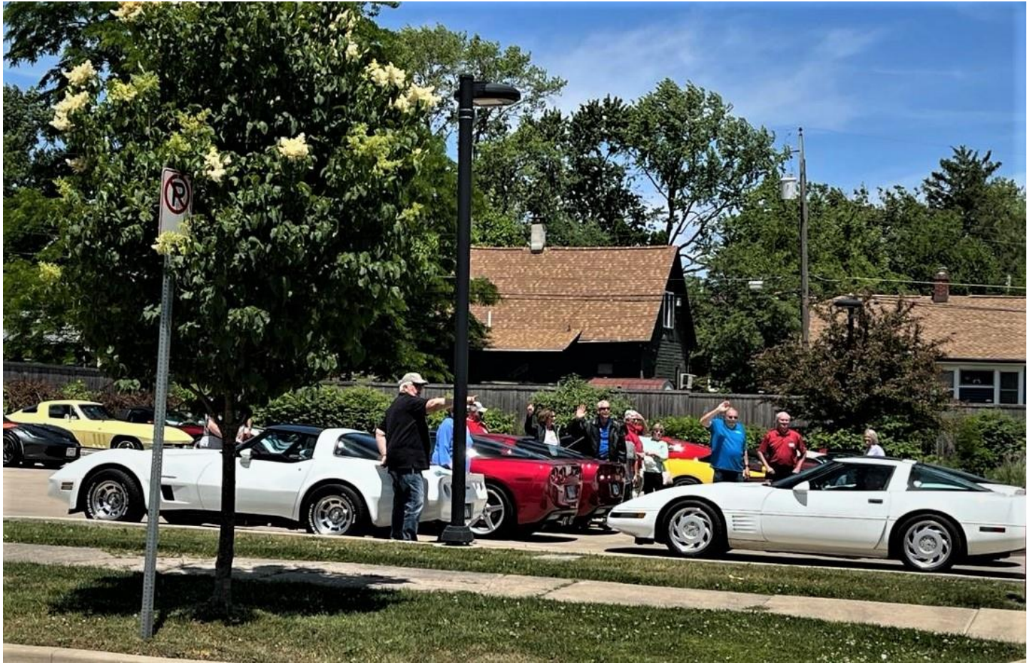
Pizza Dash at Papa Del's in Champaign with members from the Chicago Corvette Club May 27, 2023