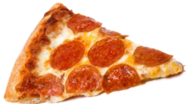
Enjoying Papa Del's with members of the Chicago Corvette Club.