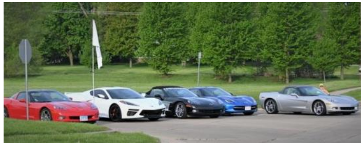
Christie Clinic Illinois Marathon—Urbana, IL - April 29, 2023