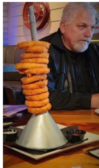
Ford's Garage Noblesville, IN April 18, 2023