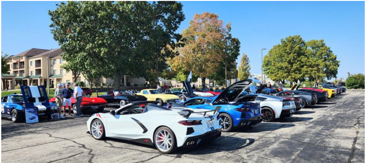
Sullivan's 100th Year Anniversary Celebration—September 30, 2023