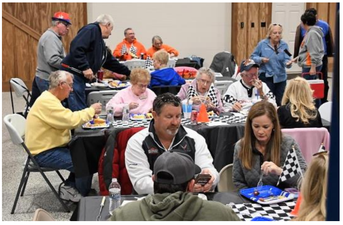
Club Weiner Roast—October 8, 2022