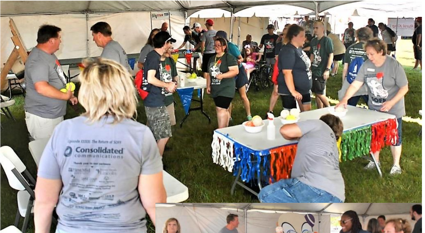
Special Olympics Family Festival September 17, 2022