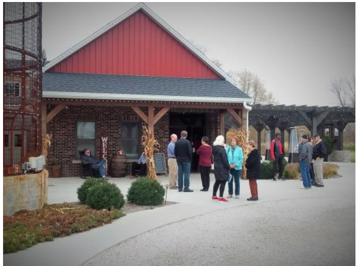
Barn III Dinner Theater — October 30, 2022