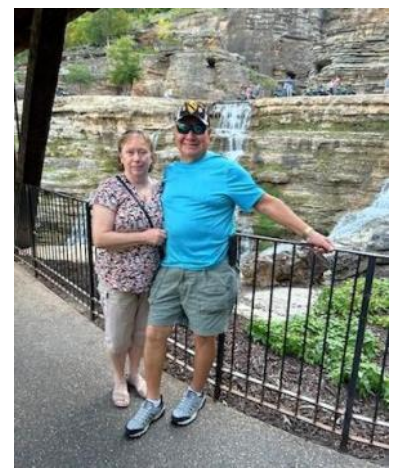
Top of the Rock—Branson, MO—September 19, 2023