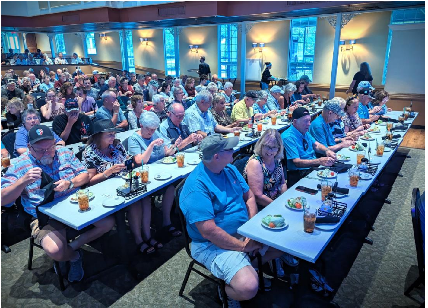
Showboat Branson Belle Dinner Cruise Riverboat on Table Rock Lake —September 19, 2023