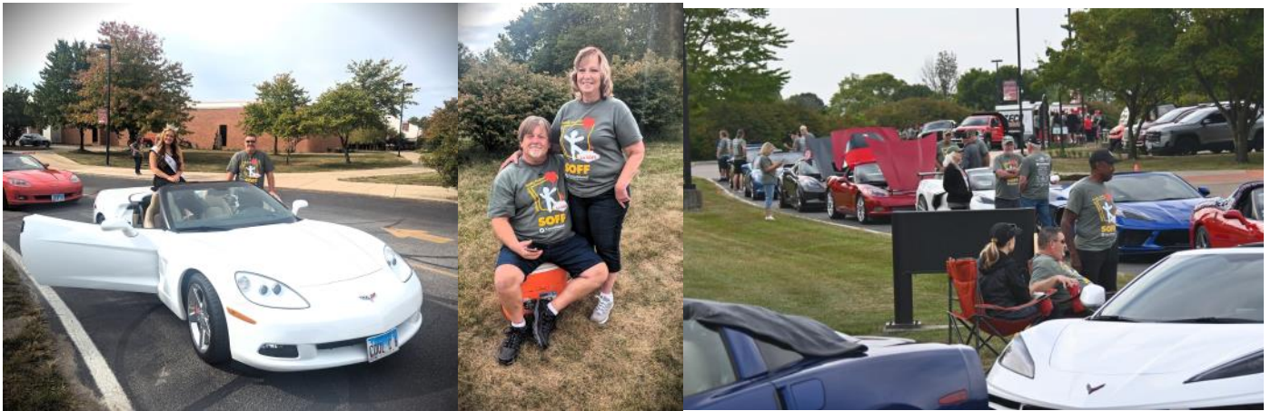
Special Olympics Family Funfest in Mattoon, IL—September 16, 2023