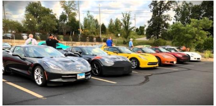
Cool rides of SIX in Branson, MO September 20, 2023