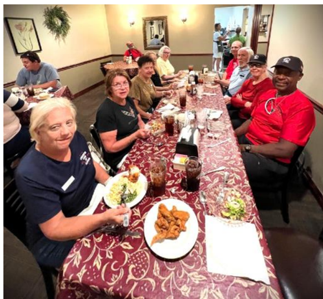
Dinner at Yoder's Kitchen in Arthur, IL—9/9/23