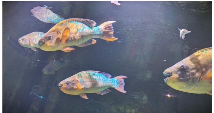
Stop at Wonders of Wildlife National Museum and Aquarium in Springfield, MO on September 22, 2023