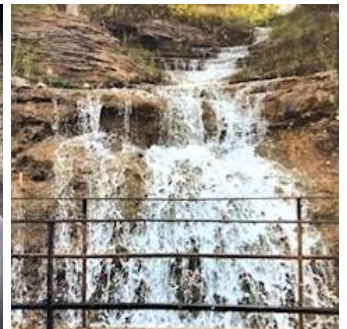
Top of the Rock—Branson, MO—September 19, 2023