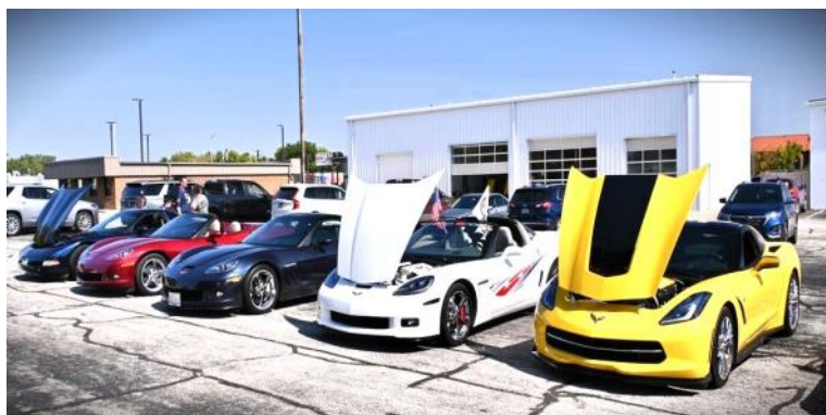
Mid-America Corvette Funfest in Effingham, IL—September 16, 2023