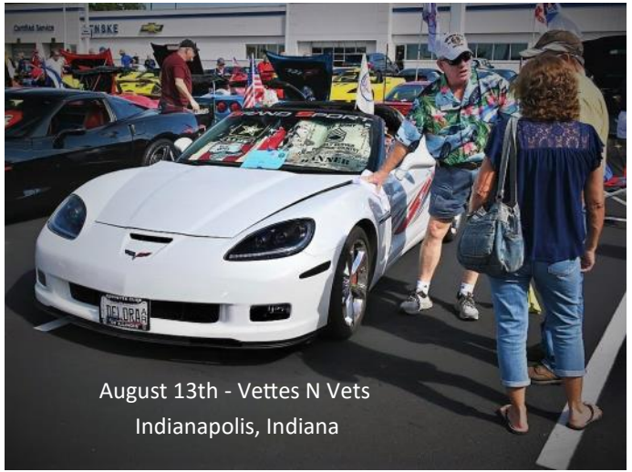
August 13th - Vettes N Vets Indianapolis, Indiana