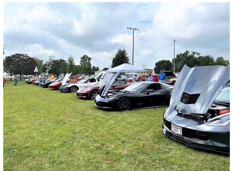
Ellsworth Car Show September 4, 2022