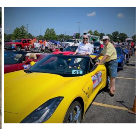
4th of July Parade Champaign, IL