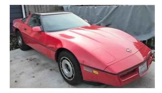
the granddaughter's '85

The '84 red coupe was a "fixer" as Rich took an opportunity to get a Corvette in the mid-90's. Two years later, he traded it for the '85 red coupe with a 4+3-speed manual transmission. He had it several years, but it then developed a bad squeak in the rear axle U-joints. He had it up on jackstands working on it when one daughter moved back in with 2 kids. A short time later, the other daughter moved back in with 2 kids so, with little time to work on it, the Corvette just sat in the garage.