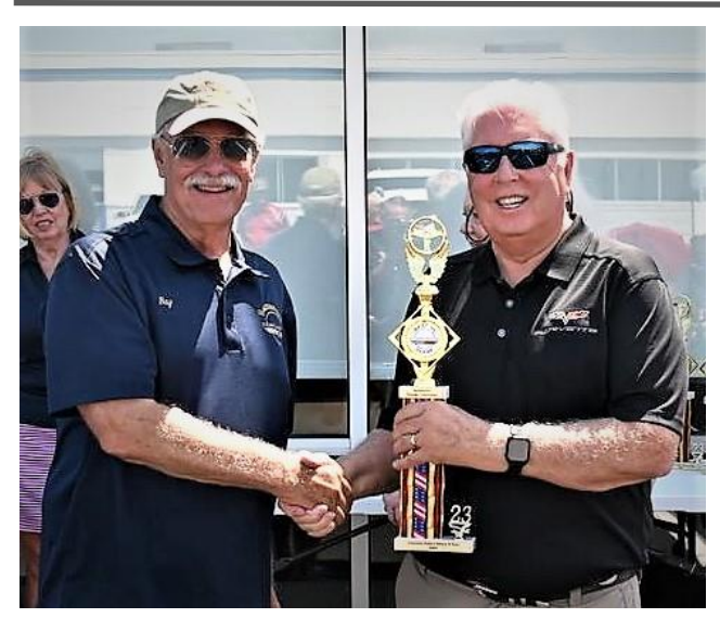
More winners at Vets 'n Vettes