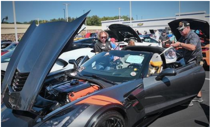
Corvette Indy Vets 'n Vettes August 12, 2023