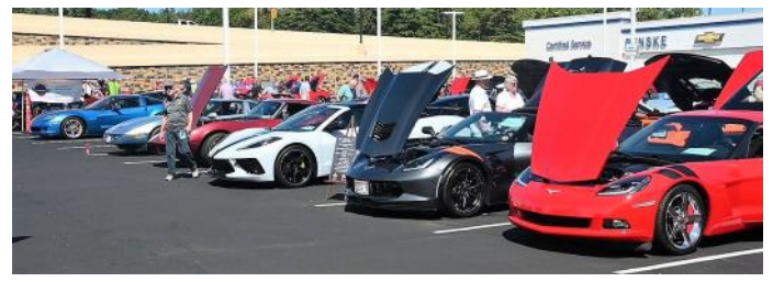
Corvette Indy Vets 'n Vettes August 12, 2023 followed by Dinner at Ford's Garage