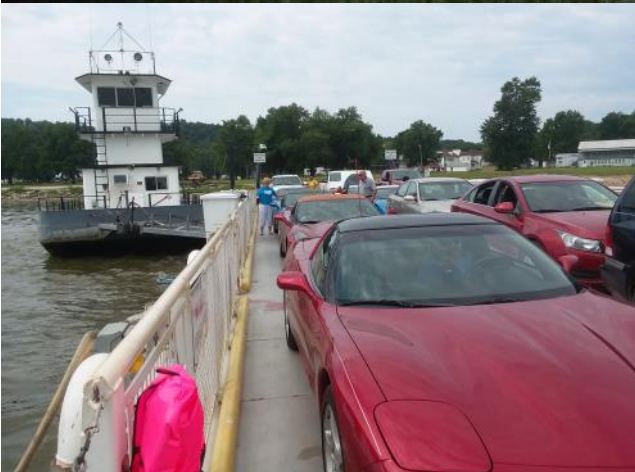
(Left) Some of us took the Campsville ferry on the way back home.