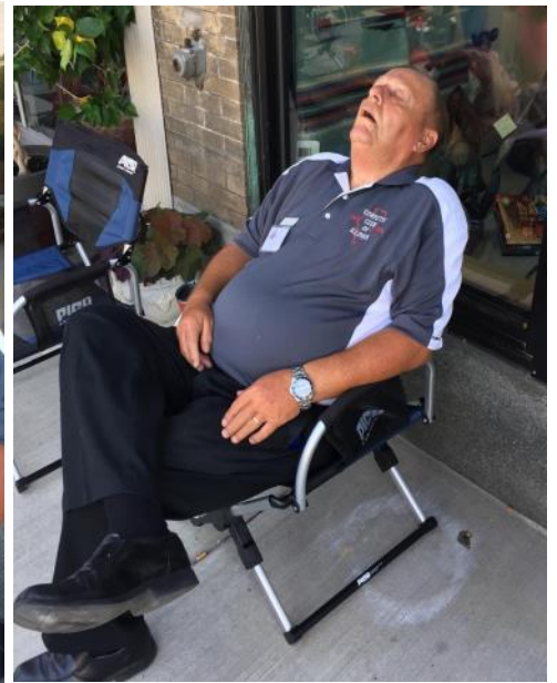
Car shows are such hard work!!!