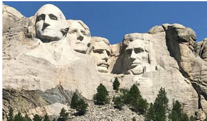
Black Hills Corvette Classic July 17-23, 2018