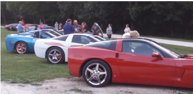
Residents and staff visit with club members after dinner.