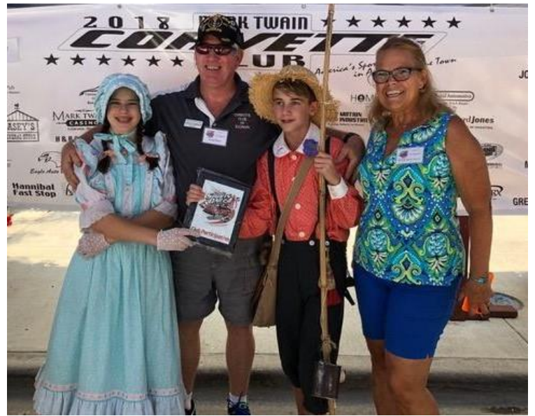
Our club received the award for having the most participants in this year's show.