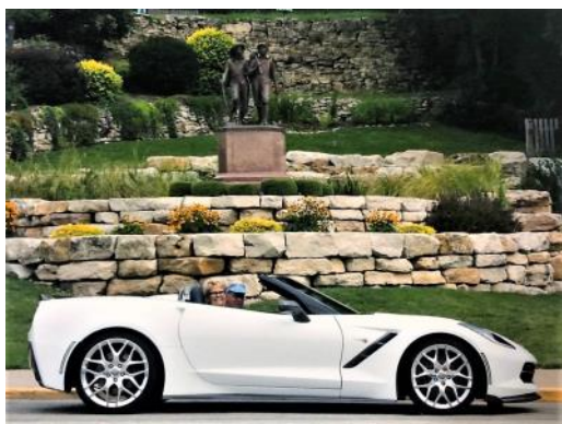
Hannibal Car Show August 3, 2019