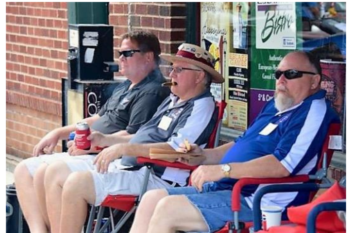
Hannibal Car Show—August 3, 2019