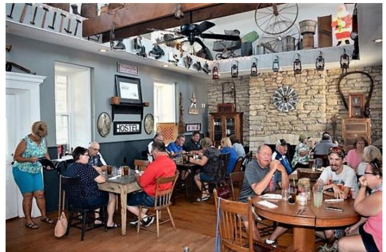
Dinner at Old Stonehouse Inn