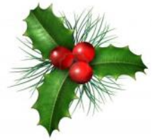
2021 Christmas Party fun.