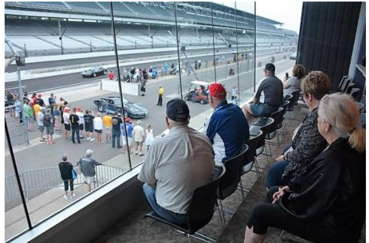
View of the track from our club suite, watching the Corvette parade.