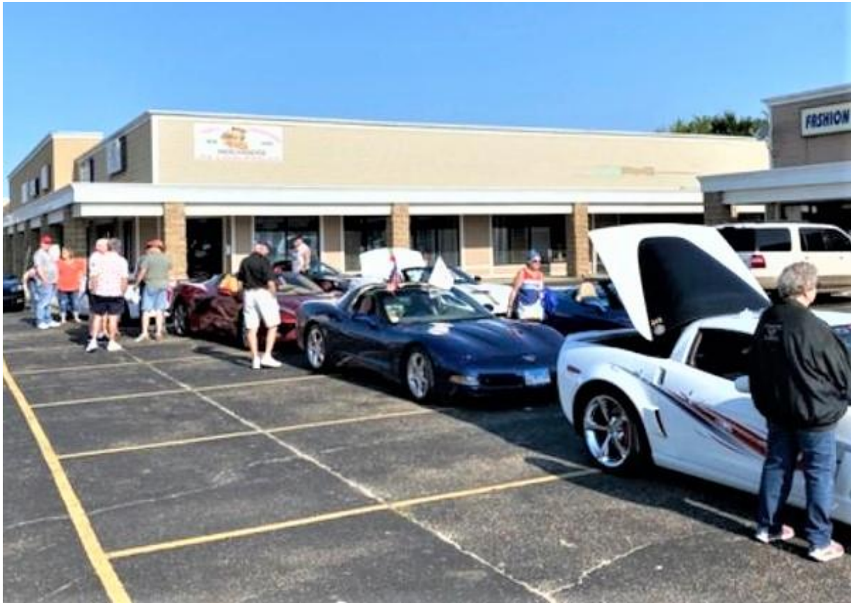
Rantoul Parade—July 3, 2021