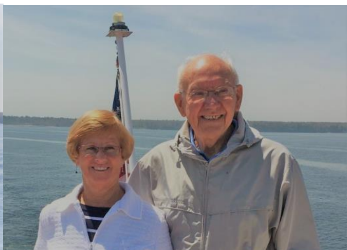
One of the highlights included a visit to Washington Island.