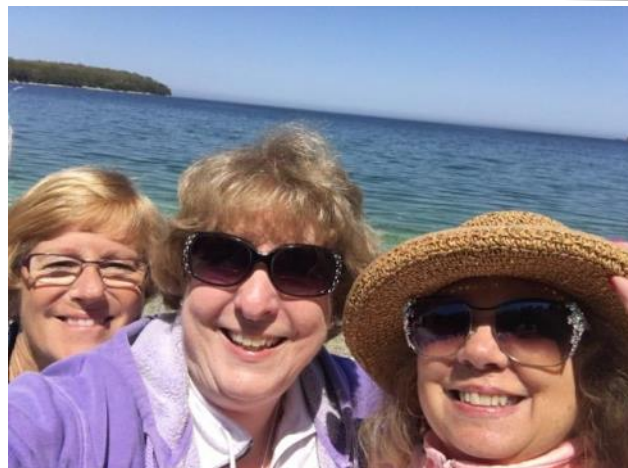
Several club members enjoyed a trip to Door County Wisconsin May 21-25.