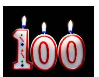
May 23, 2021

A few club members participated in a parade to celebrate the 100th birthday of Clyde Hudson at Carriage Crossing in Champaign.