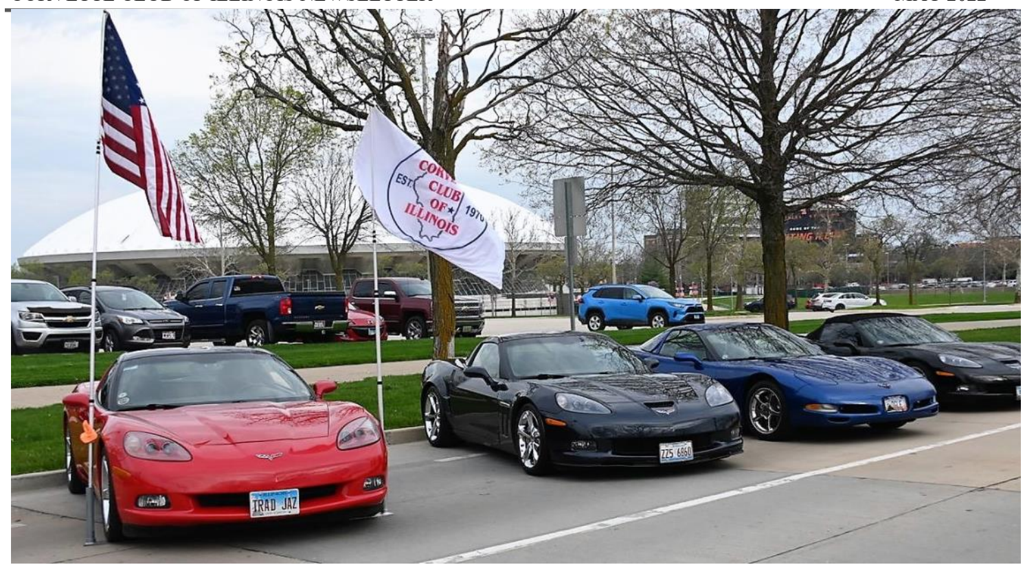
Christie Clinic Illinois Half Marathon—April 30, 2022