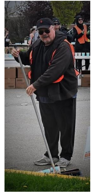
Christie Clinic Illinois Half Marathon—April 30, 2022