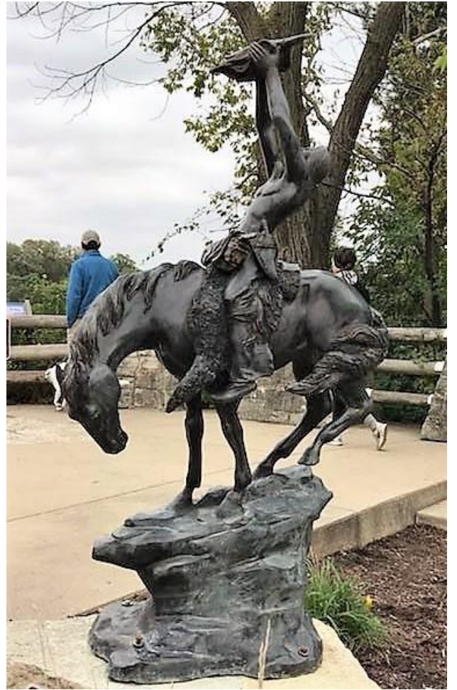
Scenes from the club trip to Starved Rock State Park on October 14, 2018.