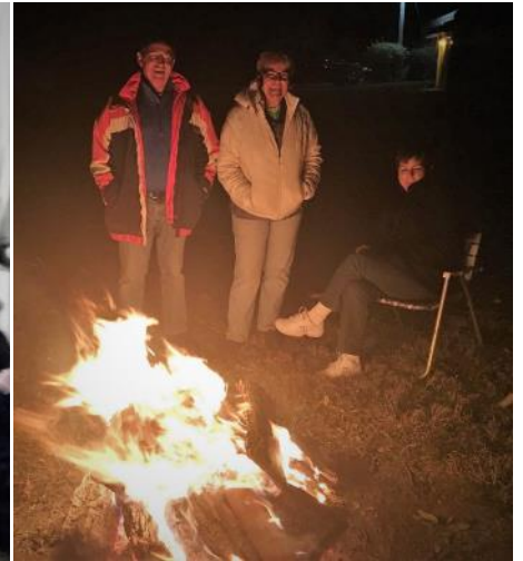
Wiener Roast October 20, 2018.