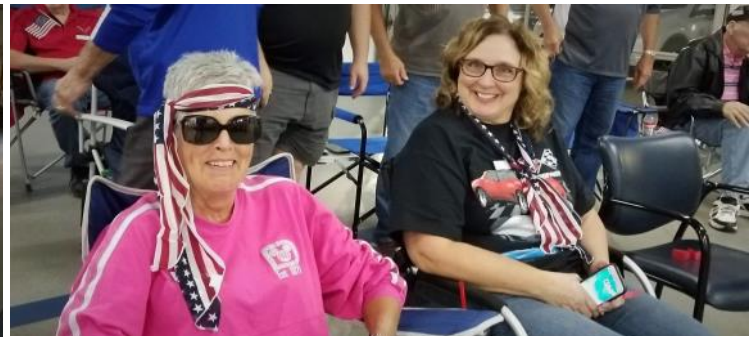
Several representatives of the Daughters of the American Revolution (DAR) distributed American Flag scarves to all of the ladies prior to the beginning of the October 8th meeting, and provided cake and punch for all to enjoy. Military veterans were presented with lapel pins, at which time they stated the branch of service and years in which they served.