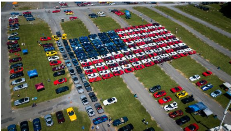
Several members' cars were among the 165 Corvettes in the American flag display created at Corvettes at Carlisle .