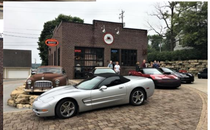
A stop was made at the American Pickers' store while in Le Claire.