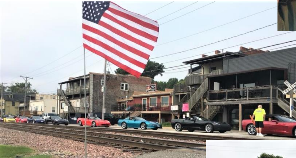
Many members attended Vettes on the River in Le Claire , IA August 24—26