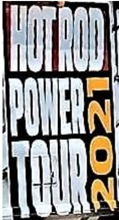
State Farm Center Champaign, IL August 27, 2021