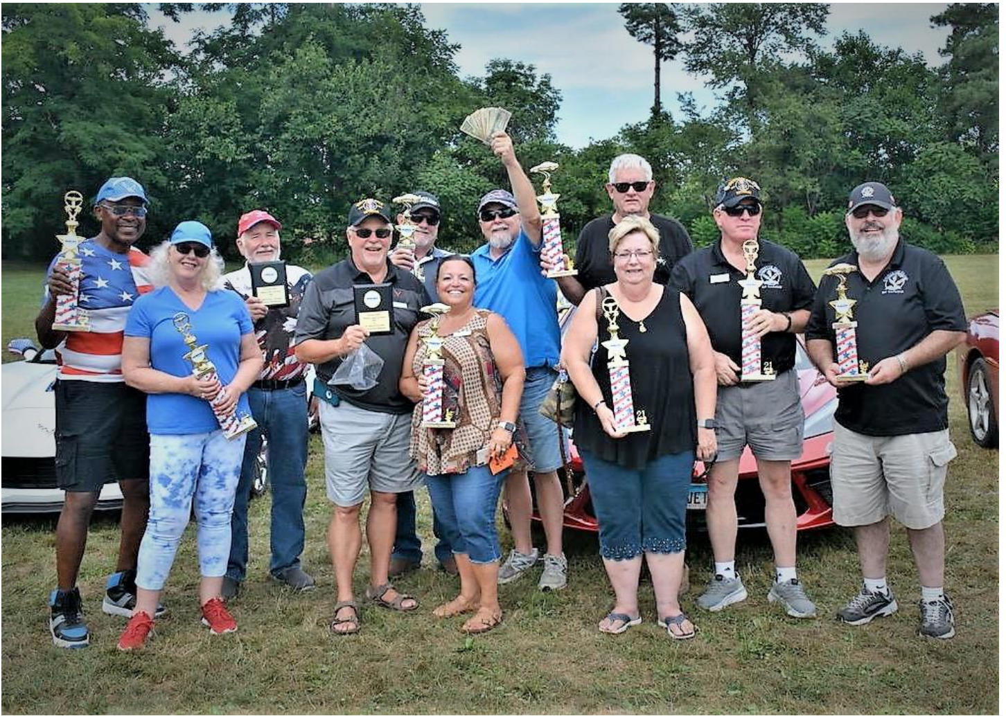
Many members came home winners from Corvette Indy's Annual All Corvette Show, "Vettes N Vets" on Saturday, August 14 th in Carmel, Indiana.