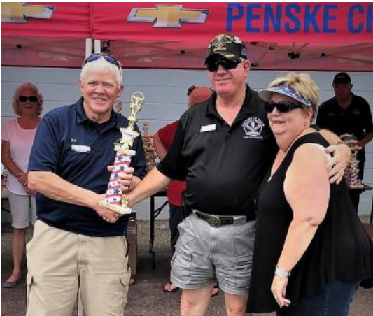
Winners at Corvette Indy's Annual All Corvette car show "Vettes N Vets" August 14 th Carmel, IN