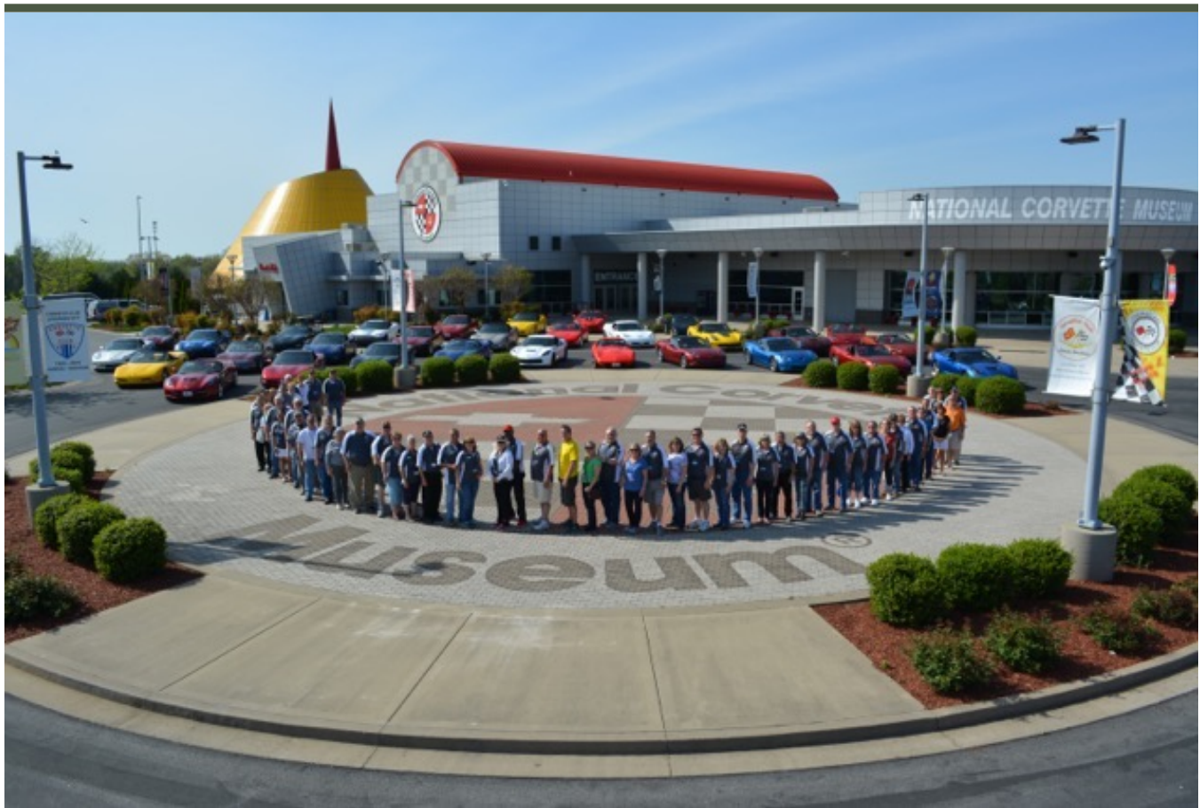
Club members pose at the National Corvette Museum in Bowling Green