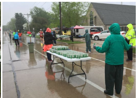
April 30 was a cold rainy day for the annual Illinois Marathon, but Club members faithfully volunteered to man the "mile 17 water station," donned in their rain gear, and dancing to the tunes played by our disc jockey. Illinois Marathon proceeds go to charity.